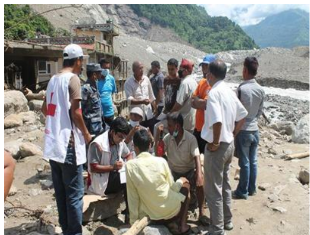
NRCS volunteers conducting needs assessments in the landslide area in Jure, Sindhupalchok.