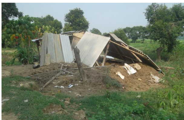
House destroyed by floods in Bardia district; Photo by NRCS/Ramesh Ghemire.