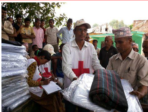
NRCS volunteer distributing non-food relief item package to the people affected by floods in Dang district; Photo by NRCS.