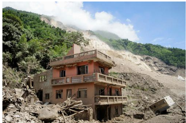
A house damaged by a landslide is seen in Sindhupalchowk district, Nepal on 2 August 2014.