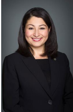
The Honourable Maryam Monsef Minister of International Development and Minister for Women and Gender Equality